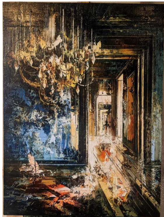
Fable , 2024, oil on canvas, 122 x 92 cm