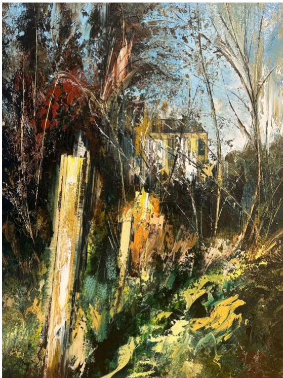
Boundary , 2024, Oil on canvas, 122 x 91 cm